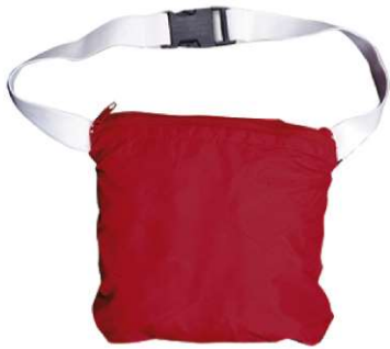
Detail: pocket bag